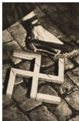
Crush Fascism - PERE CATALÀ PIC Room 79