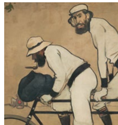
Ramon Casas and Pere Romeu on a Tandem (detail) - RAMON CASAS Room 54