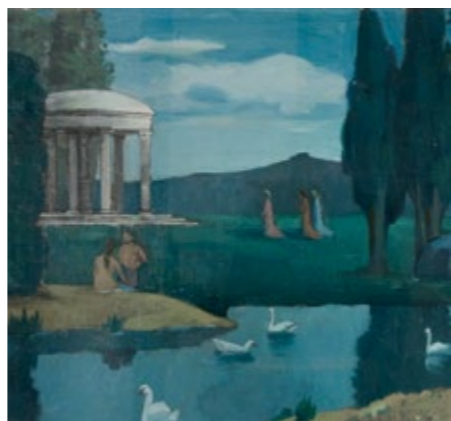
Temple to the Nymphs (detail) - JOAQUIM TORRES-GARCÍA Room 70