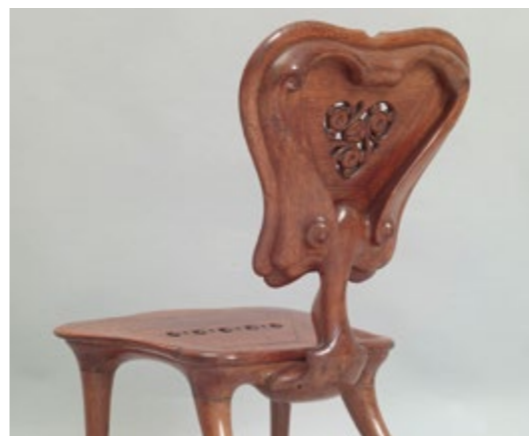
Upright chair from Casa Calvet (detail) - ANTONI GAUDÍ Room 65