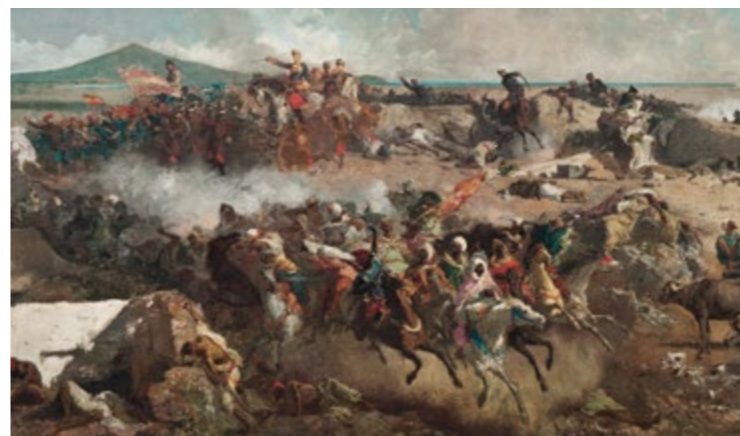
The Battle of Tetouan (detail) - MARIÀ FORTUNY Room 50