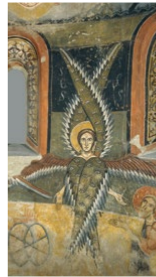
Apse from Santa Maria d'Àneu (detail) Room 4

Occasionally, some works may not be in their usual place.