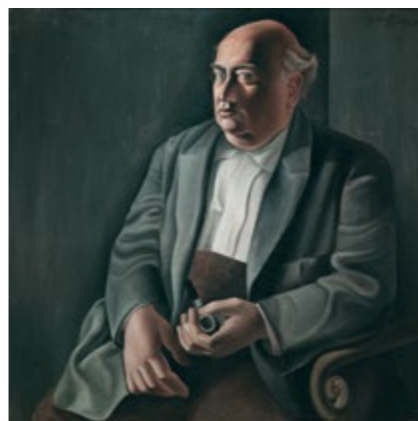
Portrait of my Father - SALVADOR DALÍ Room 72