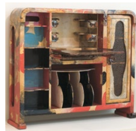
Desk for filing music scores - JOSEP MARIA JUJOL Room 66