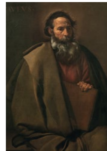
Saint Paul - DIEGO VELÁZQUEZ Room 34