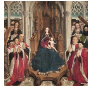
Virgin of the «Consellers» (detail) - LLUÍS DALMAU Room 26