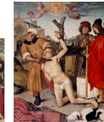
Martyrdom of Saint Cucuphas - AYNE BRU Room 28