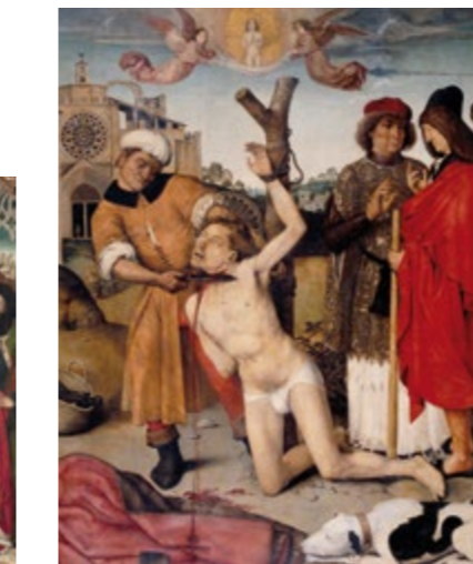
Martyrdom of Saint Cucuphas - AYNE BRU Room 28