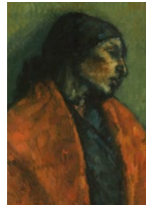
Paloma (detail) - ISIDRE NONELL Room 63