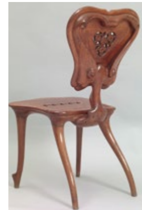
Upright chair from Casa Calvet - ANTONI GAUDÍ Room 65