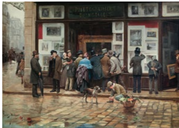
Public Exhibition of a Picture - JOAN FERRER MIRÓ Room 43

Audioguide in Catalan, Spanish, English, French, Italian, German, Russian, Japanese and Chinese. WiFi Zones: Vestibule, Oval Hall, Temporary Exhibitions Rooms, Auditoriums, Library, Dome Hall, Cafeteria and Restaurant.