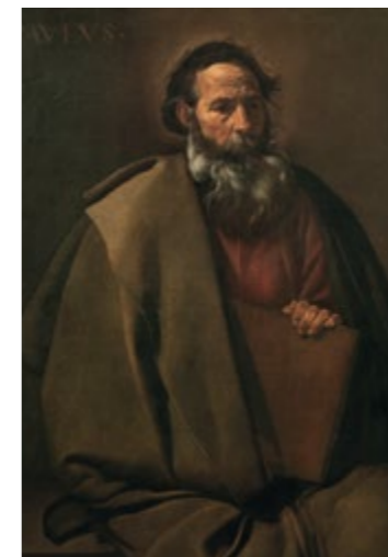
Saint Paul - DIEGO VELÁZQUEZ Room 34