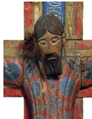
Batlló Majesty (detail) Room 10