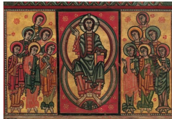
Altar frontal from La Seu d'Urgell or of the Apostles Room 5