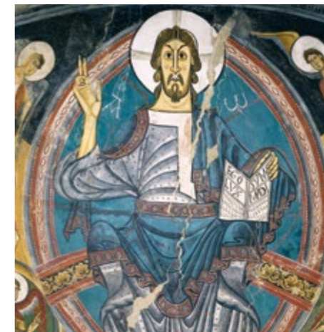
Paintings from Sant Climent de Taüll (detail) Room 7