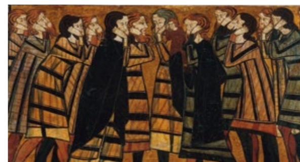
Panels from the grave of the knight Sancho Sánchez Carrillo. Mourners (detail) Room 19