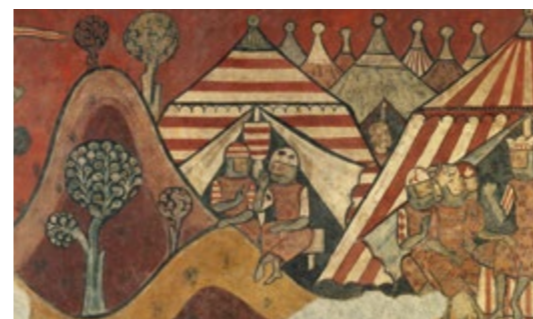
Mural paintings of the Conquest of Majorca (detail) - MASTER OF THE CONQUEST OF MAJORCA Room 17