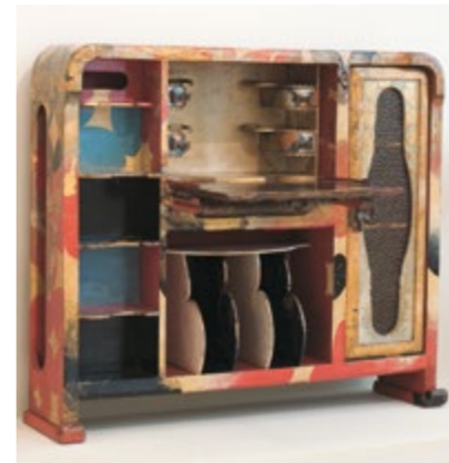
Desk for filing music scores - JOSEP MARIA JUJOL Room 66