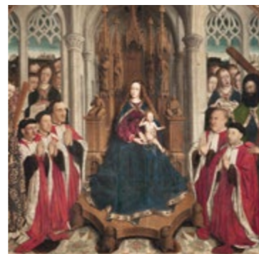
Virgin of the «Consellers» (detail) - LLUÍS DALMAU Room 26