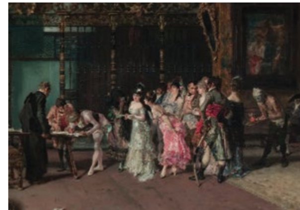
The Spanish Wedding (detail) - MARIÀ FORTUNY Room 50