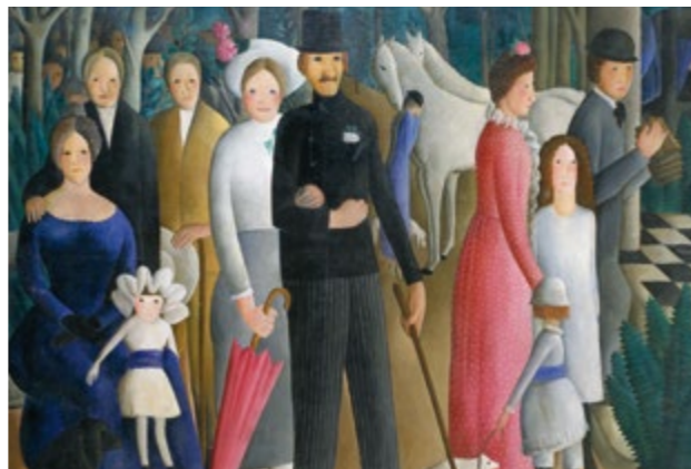
A Wedding (detail) - OLGA SACHAROFF Room 72