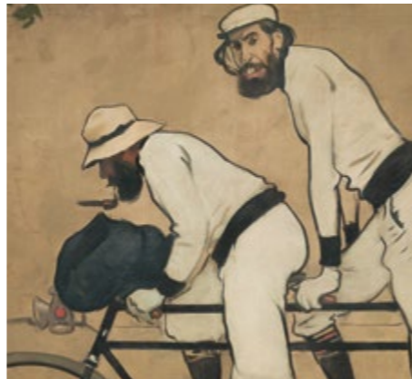
Ramon Casas and Pere Romeu on a Tandem (detail) - RAMON CASAS Room 54