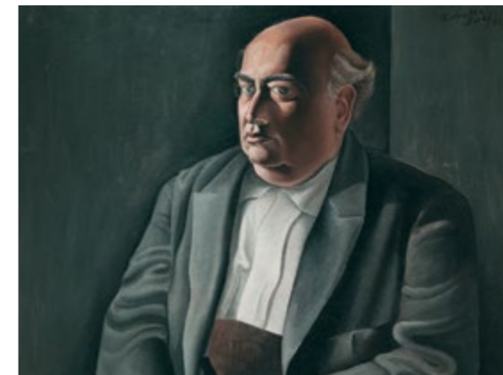
Portrait of my Father (detail) - SALVADOR DALÍ Room 73