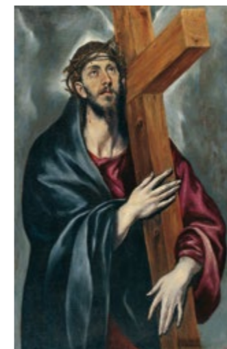
Christ Carrying the Cross - DOMÉNIKOS THEOTOKÓPOULOS (EL GRECO) Room 32