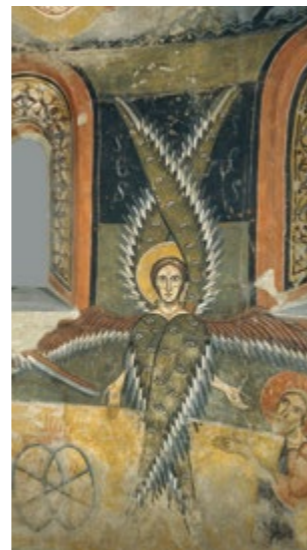
Apse from Santa Maria d'Àneu (detail) Room 4

WiFi Zones: Vestibule, Oval Hall, Temporary Exhibitions Rooms, Auditoriums, Library, Dome Hall, Cafeteria and Restaurant.