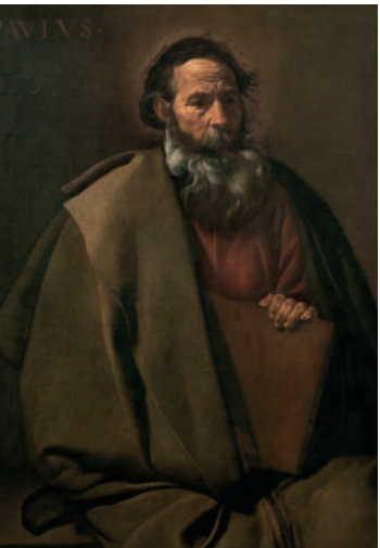
Saint Paul (detail) - DIEGO VELÁZQUEZ Room 34