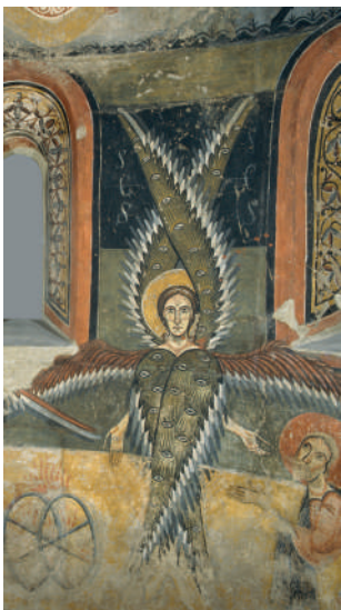
Apse from Santa Maria d'Àneu (detail) Room 4

WiFi Zones: Vestibule, Oval Hall, Temporary Exhibitions Rooms, Auditoriums, Library, Dome Hall, Cafeteria and Restaurant.