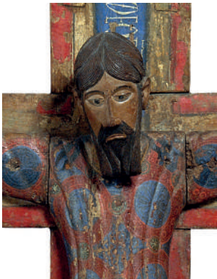
Batlló Majesty (detail) Room 10