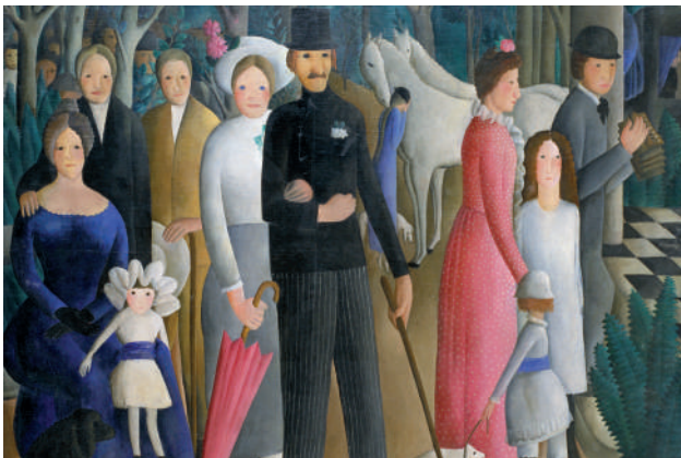
A Wedding (detail) - OLGA SACHAROFF Room 72