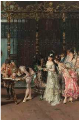
The Spanish Wedding (detail) - MARIÀ FORTUNY Room 50