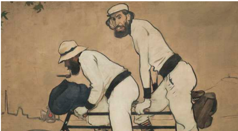
Ramon Casas and Pere Romeu on a Tandem (detail) - RAMON CASAS Room 54