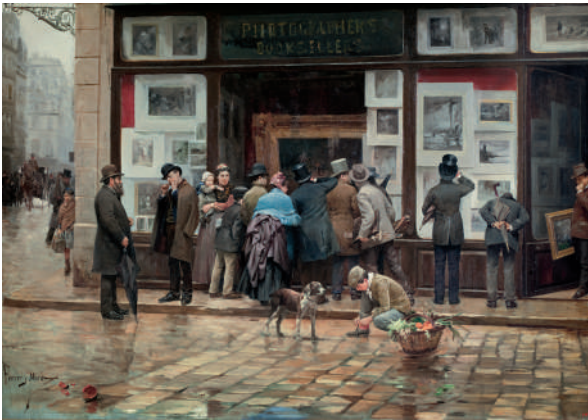
Public Exhibition of a Picture (detail) - JOAN FERRER MIRÓ Room 43