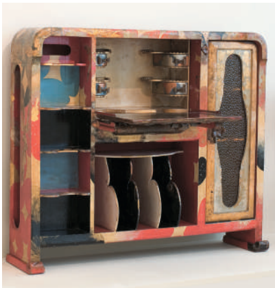
Desk for filing music scores - JOSEP MARIA JUJOL Room 66