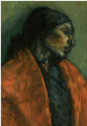
Paloma (detail) - ISIDRE NONELL Room 39

WiFi Zones: Vestibule, Oval Hall, Temporary Exhibitions Rooms, Auditoriums, Library, Dome Hall, Cafeteria and Restaurant.