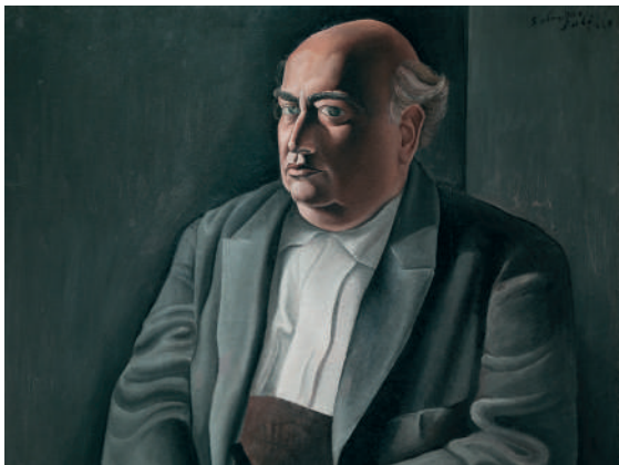
Portrait of my Father (detail) - SALVADOR DALÍ Room 73