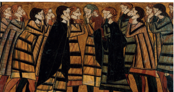
Panels from the grave of the knight Sancho Sánchez Carrillo. Mourners (detail) Room 19