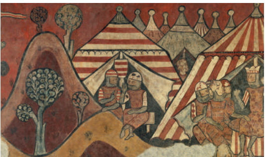
Mural paintings of the Conquest of Majorca (detail) - MASTER OF THE CONQUEST OF MAJORCA Room 17