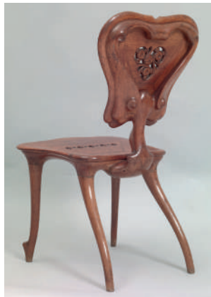
Upright chair from Casa Calvet - ANTONI GAUDÍ Room 65