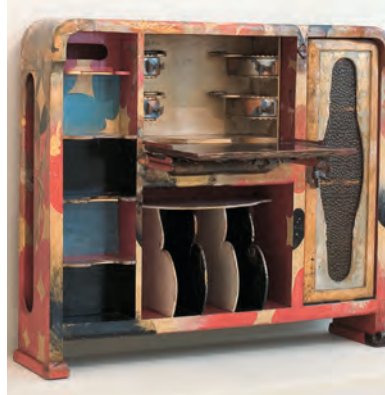
Desk for filing music scores - JOSEP MARIA JUJOL Room 66