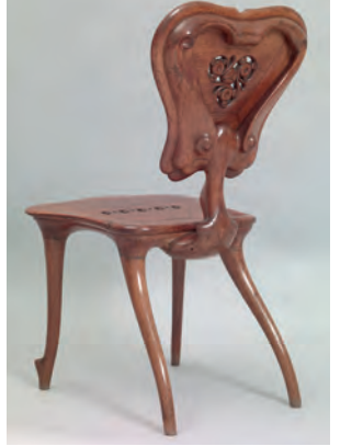
Upright chair from Casa Calvet -ANTONI GAUDÍ Room 65