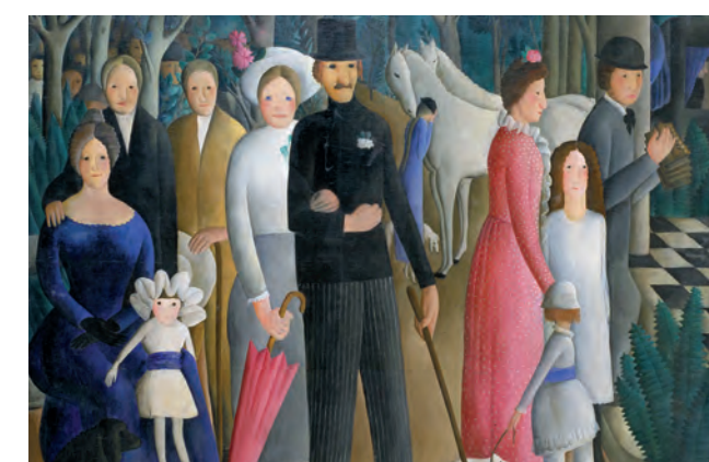
A Wedding (detail) - OLGA SACHAROFF Room 72