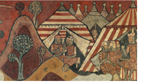
CONQUEST OF MAJORCA Room 17