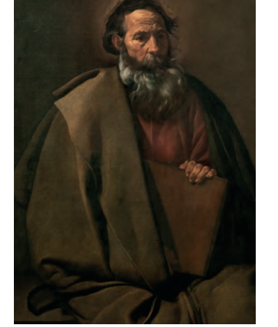
Saint Paul (detail) - DIEGO VELÁZQUEZ Room 34

Paintings from Sant Climent de Taüll (detail)