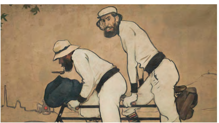
Ramon Casas and Pere Romeu on a Tandem (detail) - RAMON CASAS