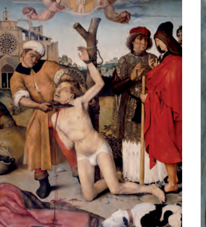
Martyrdom of Saint Cucuphas (detail) - AYNE BRU