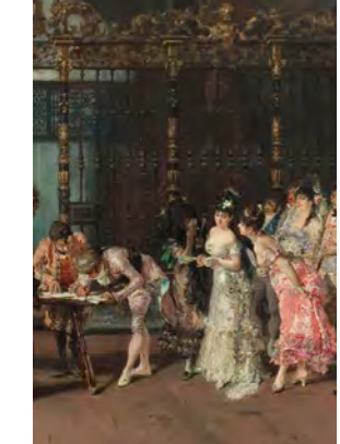
The Spanish Wedding (detail) -MARIÀ FORTUNY Room 50