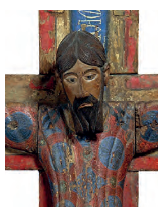
Batlló Majesty (detail)