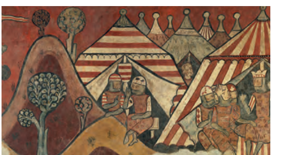
Mural paintings of the Conquest of Majorca (detail) - MASTER OF THE