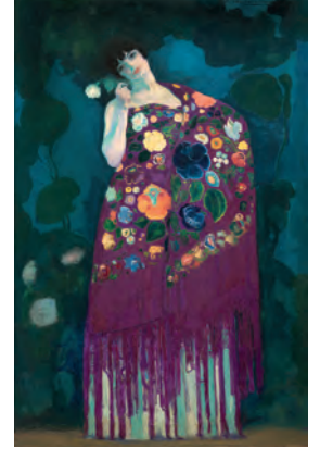
Granadina - HERMEN ANGLADA CAMARASA Room 49