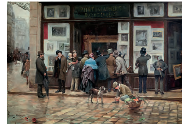
Public Exhibition of a Picture (detail) - JOAN FERRER MIRÓ Room 43