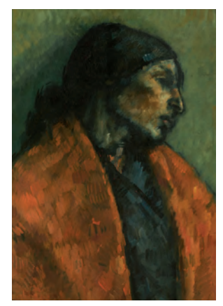
Paloma (detail) - ISIDRE NONELL Room 39

WiFi Zones: Vestibule, Oval Hall, Temporary Exhibitions Rooms, Auditoriums, Library, Dome Hall, Cafeteria and Restaurant.