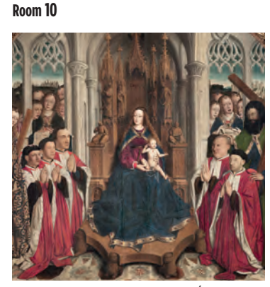
Virgin of the «Consellers» (detail) - LLUÍS DALMAU