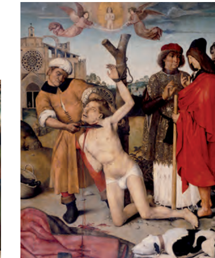
Martyrdom of Saint Cucuphas - AYNE BRU Room 28