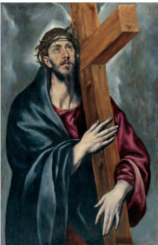
Christ Carrying the Cross - DOMÉNIKOS THEOTOKÓPOULOS (EL GRECO) Room 32