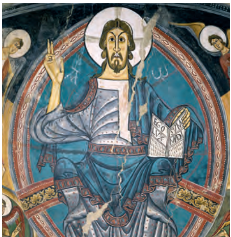
Paintings from Sant Climent de Taüll (detail) Room 7