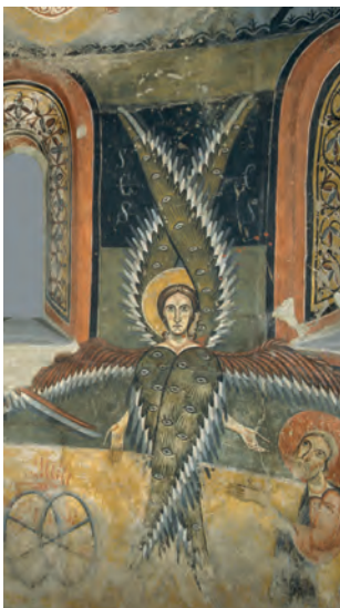
Apse from Santa Maria d'Àneu (detail) Room 4

WiFi Zones: Vestibule, Oval Hall, Temporary Exhibitions Rooms, Auditoriums, Library, Dome Hall, Cafeteria and Restaurant.