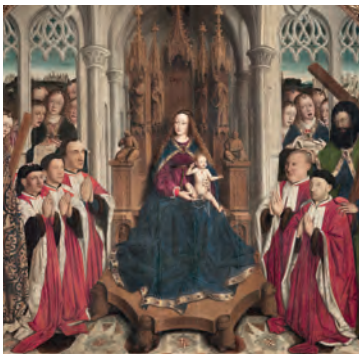
Virgin of the «Consellers» (detail) - LLUÍS DALMAU Room 26