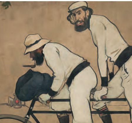
Ramon Casas and Pere Romeu on a Tandem (detail) - RAMON CASAS Room 54