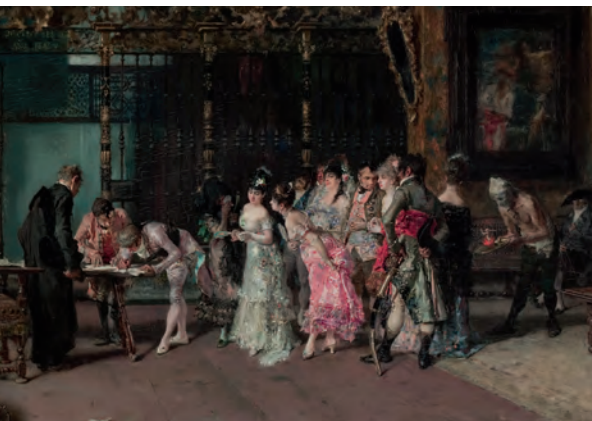
The Spanish Wedding (detail) - MARIÀ FORTUNY Room 50