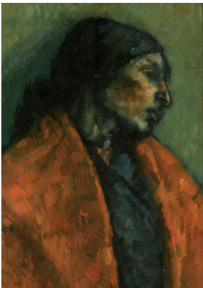
Paloma (detail) - ISIDRE NONELL Room 63