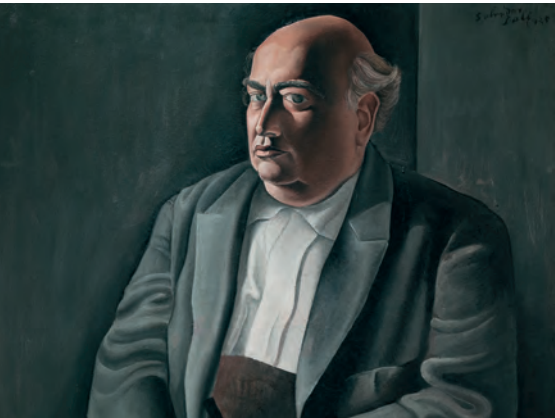
Portrait of my Father (detail) - SALVADOR DALÍ Room 73