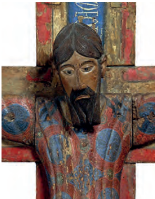
Batlló Majesty (detail) Room 10