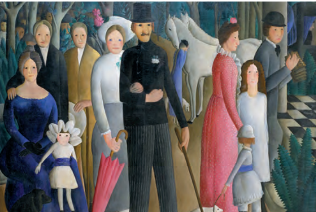
A Wedding (detail) - OLGA SACHAROFF Room 72