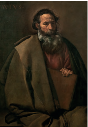
Saint Paul - DIEGO VELÁZQUEZ Room 34