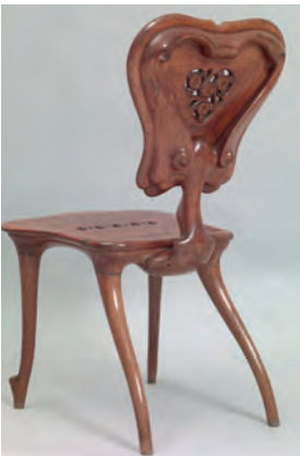
Upright chair from Casa Calvet - ANTONI GAUDÍ Room 65