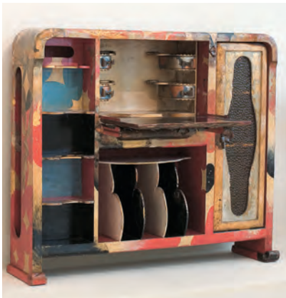
Desk for filing music scores - JOSEP MARIA JUJOL Room 66