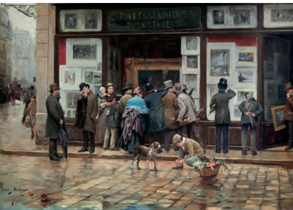
Public Exhibition of a Picture - JOAN FERRER MIRÓ Room 43

WiFi Zones: Vestibule, Oval Hall, Temporary Exhibitions Rooms, Auditoriums, Library, Dome Hall, Cafeteria and Restaurant.