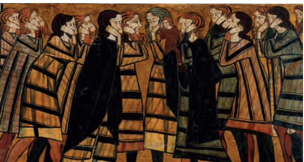
Panels from the grave of the knight Sancho Sánchez Carrillo. Mourners (detail) Room 19