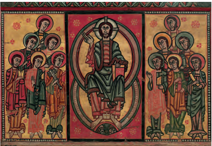
Altar frontal from La Seu d'Urgell or of the Apostles Room 5