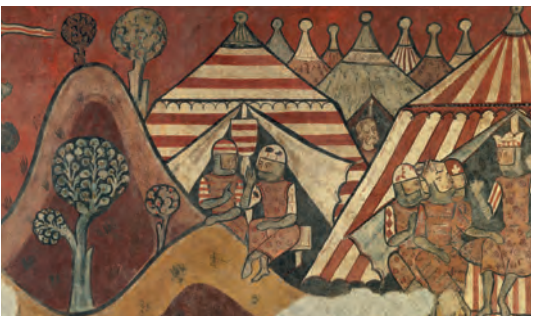
Mural paintings of the Conquest of Majorca (detail) - MASTER OF THE CONQUEST OF MAJORCA Room 17