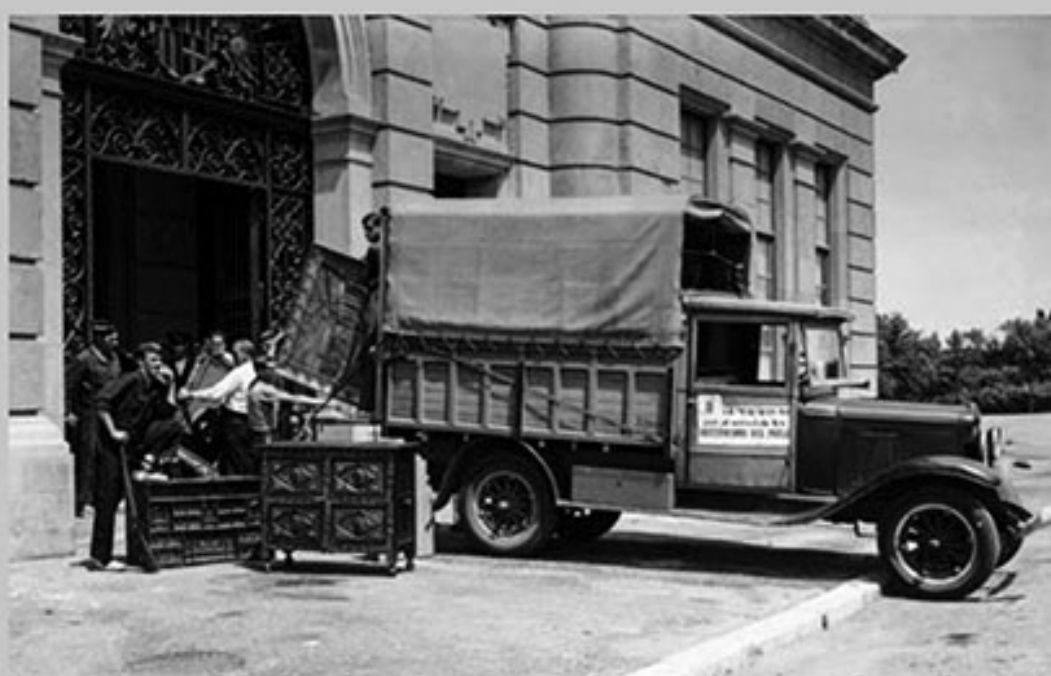
Admission of confiscated works of art to be safeguarded at the Museu d'Art de Catalunya. Palau Nacional, Barcelona. July 1936.

The authorities organised the first large gatherings of works of art and collections at the Palau Nacional, the home of the current Museum.