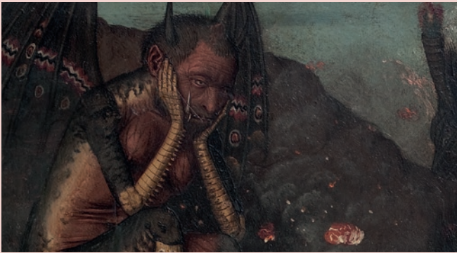
Descent of Christ into Limbo . Detail, 1475. Museu Nacional d'Art de Catalunya