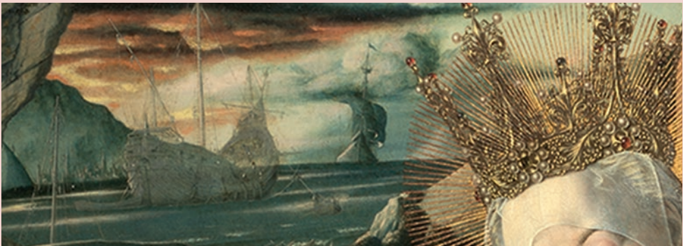
Triptych of the Virgin of Montserrat . Detail, 1483-1484. Diocesi di Acqui-Cattedrale N. Signora Assunta, Acqui Terme