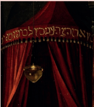
Death and Assumption of the Virgin . Detail, 1468-1472. Staatliche Museen zu Berlin, Gemäldegalerie