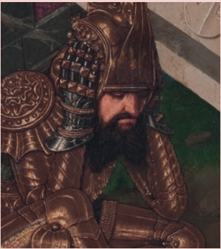
Resurrection . Detail, 1470-1475. Museu Nacional d'Art de Catalunya